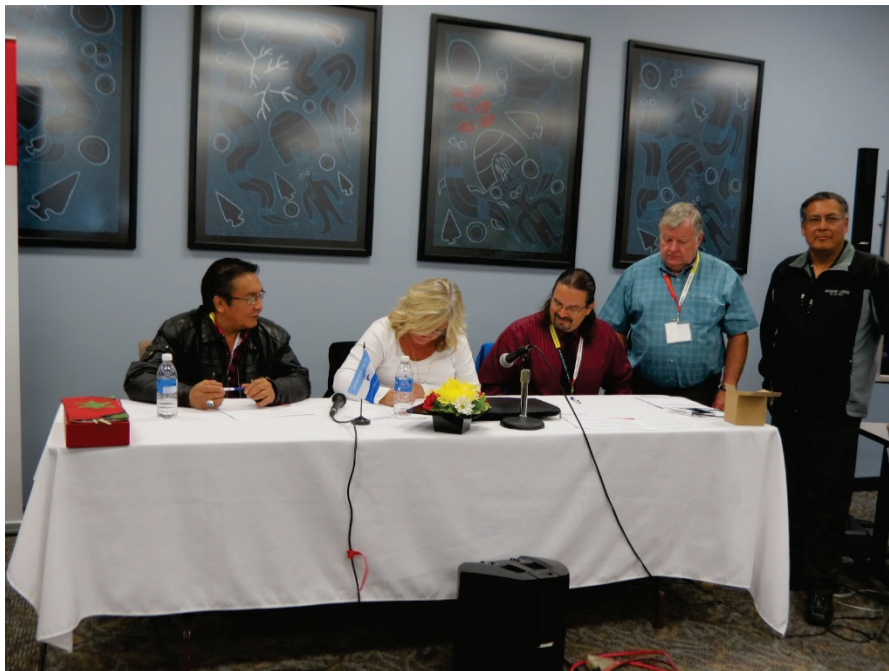
Signing of the CEDI Agreement, Regional Distribution Centre